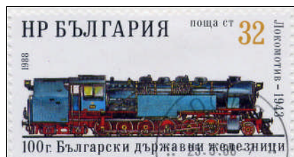
A Bulgarian 2-12-4T of 1943.