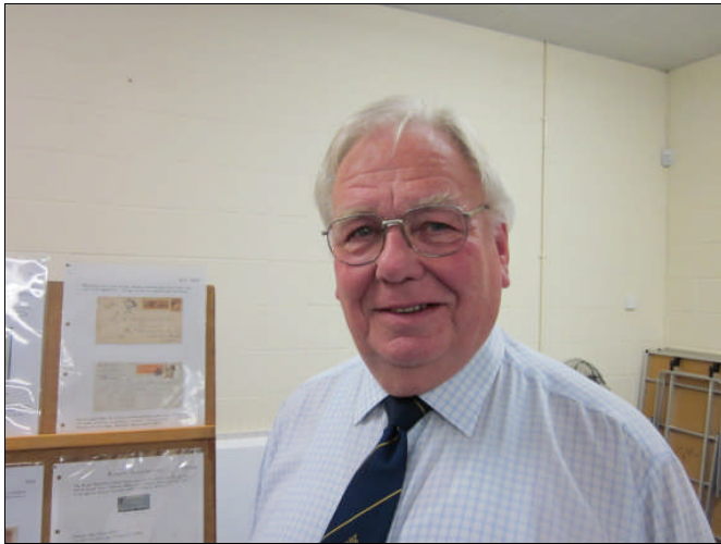
7 November - Display by Malling P.S.

us through the various definitive and other issues to the middle of the 20 th Century.