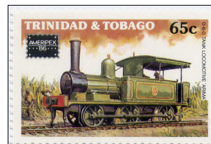
0-6-0T "Arima" used in Trinidad's sugar cane fields.

For heavy loads, four contact points were insufficient to transmit the force necessary to haul and brake the train. Addition of a further driving axle added two more contact points and improved haulage and braking capacity accordingly. The first six-coupled design, the 0-6-0 with three driving axles joined by coupling rods, appeared within a few years of the introduction of the steam locomotive. In the early days, these locomotives were primarily for slow, heavy freight work and it remained the most popular arrangement for all kinds of shunting tank engines (0-6-0T, 0-6-0ST, 0-6-0PT) and later diesel and electric shunters.