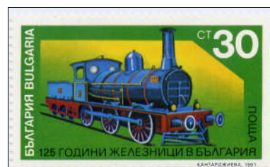
Bulgarian mixed traffic 0-6-0.

Later, the 0-6-0 tender locomotive became popular as a mixed traffic locomotive, able to handle everyday medium passenger or goods work with equal ease.