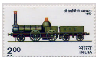
Indian 2-4-0 passenger locomotive.

A problem with the basic 0-4-0 arrangement described in Part 3 was that it was unstable at speed and did not like taking curves. It was quickly realised that putting a leading axle ahead of the driving axles, with smaller wheels and extra sideways freedom of movement ("side play"), controlled by springs, steered the locomotive into bends and reduced sideways oscillation ("hunting"). Thus was the 2-4-0 arrangement born. It became popular for suburban passenger services in the mid-Victorian period.