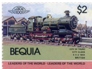
Record Holder - GWR 4-4-0 "City of Truro" was the first 100mph locomotive.

Modern 4-4-0 of Great Northern Railway (Ireland).