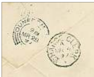
Backstamped with scarce CHARGE CLERK (Cape Town) 4th March 1897 and Dunfermline 28th March 1897, arrival cds.

sandy like the Kalahari Desert, fortunately we have excellent water from a spring. But at the Langeberg, where the fighting is, the water is bad. I am glad I am not there. □