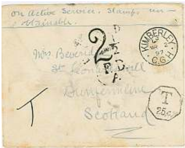
A stampless cover to Scotland from a member of the Imperial Forces engaged in the "Langeberg Rebellion" (also known as the Bechuanaland or Rinderpest Campaign).

sandy like the Kalahari Desert, fortunately we have excellent water from a spring. But at the Langeberg, where the fighting is, the water is bad. I am glad I am not there. □