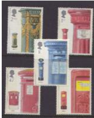
G.B. Post Box set