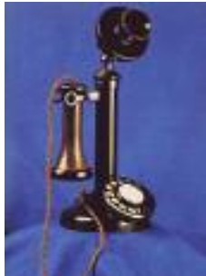
'Allo again Doris

Yes I've ad some in me younger days I can tell yer. Big 'angovers an' can't eat ther christmas dinner wot we've all slaved over such a waste innit. Apart from orl that bit of how