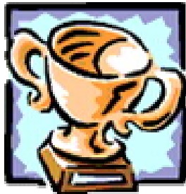
Member of the Year

given including our financial state. There was concern by all present that our expenses are increasing and we unfortunately made a loss during the year. However this is something the Committee will be looking at during the forthcoming months. By the time you read this hopefully some ground will have been gained on the situation.