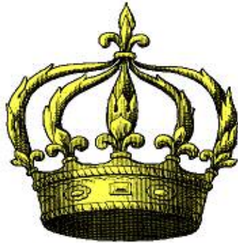
King George V