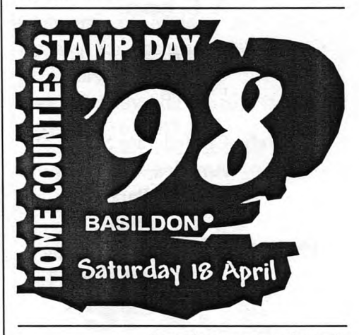
from front page column 2

http://ourworld.compuserve.com/homepages/charles_mead/bps.htm