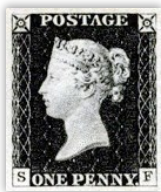
The world's first postage stamp, the Penny Black .

There is a charge of £1.00 per meeting which includes free refreshments.