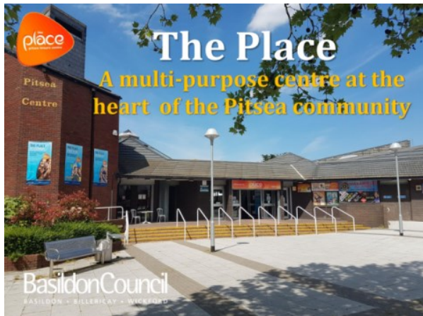
Pitsea Leisure Centre aka The Place

If you are still not sure whether the Basildon Philatelic Society is for you, then you are cordially invited to attend a meeting as our guest.