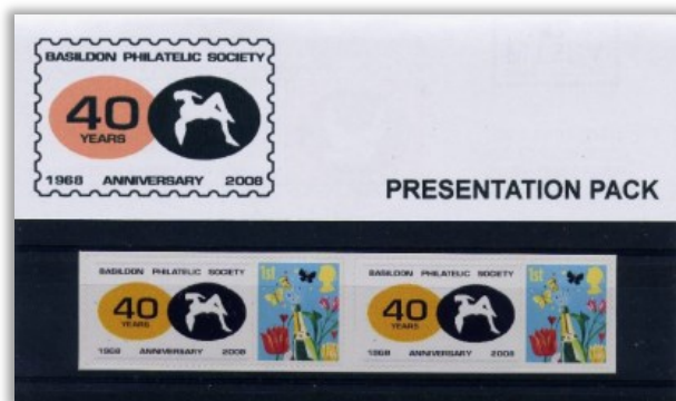
The Society marked its 40th year by issuing a presentation pack in 2008.