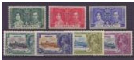
Malta, Coronation & Jubilee

nice range of early Austrian including those from 1850 on hand made paper.