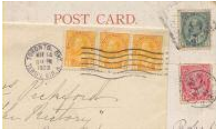
Canada KG V