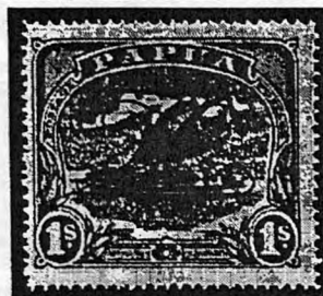
PAPUA. 1930 1/- sepia and olive. VARIETY INVERTED AEROPLANE. Realised £2,090 in a recent auction.

We will be pleased to inspect and advise on your stamps, postal history or airmail collections without obligation. We can fully appraise all family archives, portfolios etc. for inclusion in our regular Bond Street auctions.